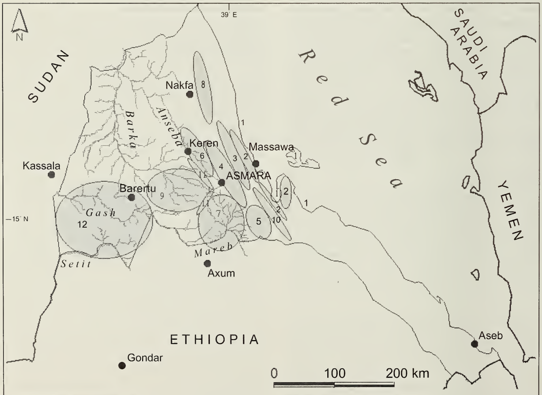
Figure 1. Approximate position and extent of ecogeographical zones in Eritrea (1 = coast, islands, sea; 2 = coastal lowland; 3 = central-eastern escarpment; 4 = central plateau; 5 = southern plateau; 6 = Anseba River catchment; 7 = Mareb River catchment; 8 = north-eastern escarpment; 9 = Barka River catchment; 10 = south-eastern escarpment; 11 = south-western escarpment; 12 = south-western lowlands).

Of interest are my records of Maccoa Duck and Ring-necked Dove Streptopelia capicola , both of which have not been mentioned in specific lists for Eritrea 15,15 , but were mapped for the country by Snow 16 . Also two 'introduced' species occur very locally in Eritrea, Indian House Crow Corvus splendens in Massawa and Hirghigo and House Sparrow Passer domesticus in Keren, Akordad and Barentu, but not